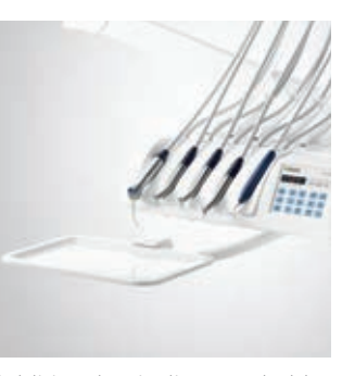
Additional swiveling tray holder for CS dentist element