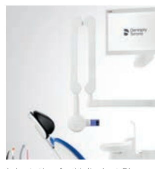
Adaptation for Heliodent Plus unit model