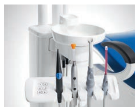
Compact assistant element