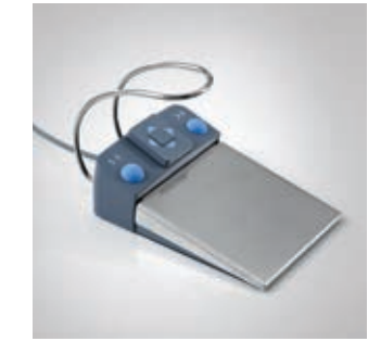
Comfort assistant element with C+ electronic foot control