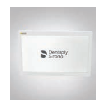
22" AC monitor