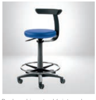
Paul working stool (pictured with additional foot ring)