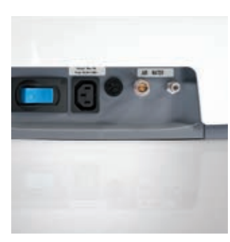
Valve set for external devices