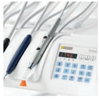
Satelec Mini LED curing light