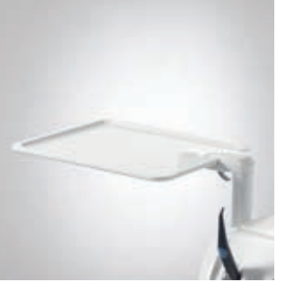
for TS dentist element