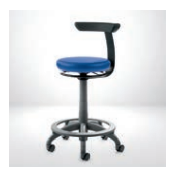
Carl working stool