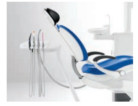
Comfort assistant element

Both assistant elements are very space-saving and ensure maximum freedom of movement. With the Comfort model, you can work comfortably even without an assistant.