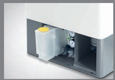
Chemical suction hose cleaning Cleaning agent container for chemical flushing of the suction lines. The concentration of cleaning agents can be individually adjusted.