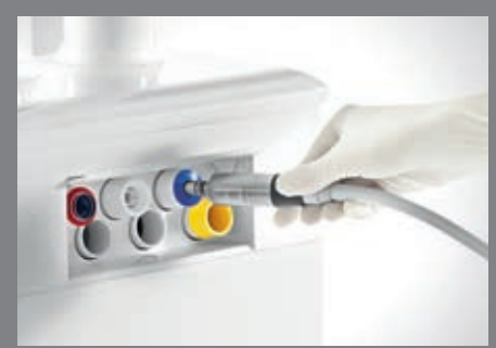
Integrated cleaning adapters For automatic purging of instrument hoses (Autopurge) and sanitization of the water lines.