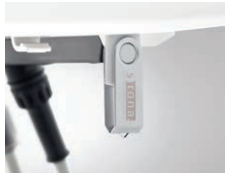
Integrated USB interface

With this HD monitor, you can explain intra-oral camera and X-ray images, software and planning views, videos and PowerPoint presentations to your patient directly at the treatment center.