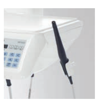
Additional holder for camera (for TS dentist element)