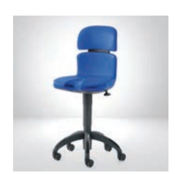
Hugo working stool