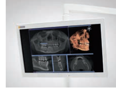
Sivision 22" AC monitor