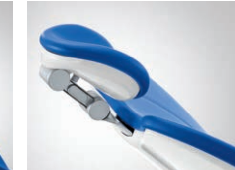
Double articulating headrest