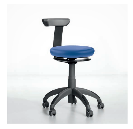
Carl Manual Manual height adjustment