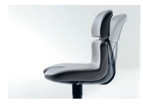
The backrest – for more dynamic support

Hugo is a key element in the Dentsply Sirona ergonomics program and combines unique technologies. It promotes ergonomic and intuitive sitting and enables you to maintain a healthy posture throughout the treatment process. Dynamic, comfortable, hygienic, and versatile – the perfect complement to your treatment center.