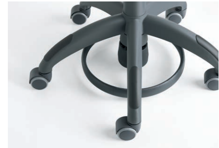
The stool base - for more flexibility

The innovative OptiMotion mechanism with flexible tilt of the front of the left or right half of the seat ensures more freedom of movement and optimal access to the patient. This simultaneously reduces pressure points on the thighs considerably. The thermo upholstery provides increased comfort during prolonged treatment sessions.