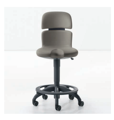
Hugo Manual Plus

Manual height adjustment, with foot ring