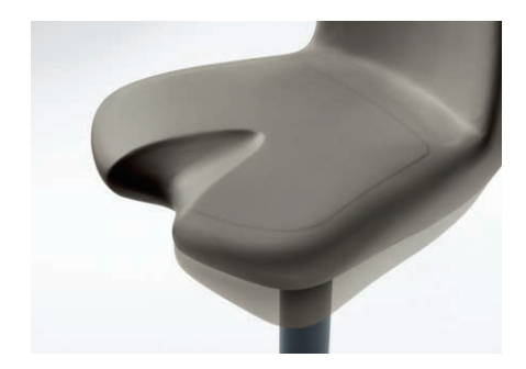
The seat - for more comfort

The dynamic Hugo backrest gives you more flexibility during treatments. The backrest follows your movements and provides support - while you work and when you relax. Your spine is automatically straightened, effectively preventing muscle strain.