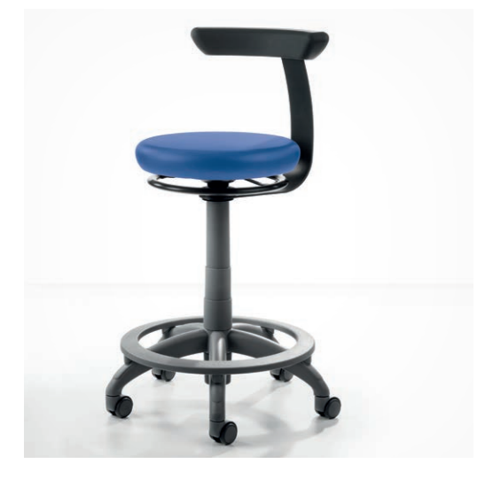
Carl Manual Plus Manual height adjustment, with foot ring