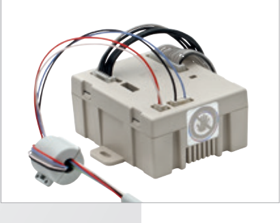
Piezo built-in kit

The shape of the handpiece and its light weight allow you to work for longer without tiring.