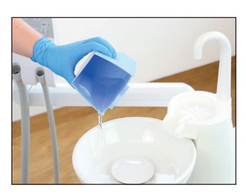
4. Empty the remaining solution (200 ml) into the spittoon bowl and allow to act