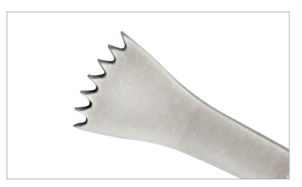
Improved cutting precision

The shadow-free light ensures ideal illumination of the operating site.