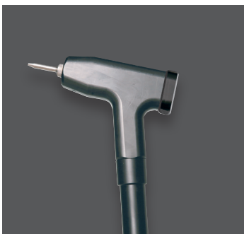
Comfortable usage because of single-handed operation of the steam gun