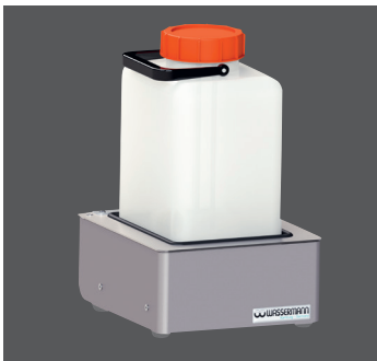
Accessory: Fill unit (5 Liter) for manual filling and flexible choice of location, operation with distilled/softened water is possible and recommended