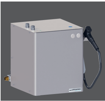
Wasi-Steam Compact, version with accessory, to regulate wet steam saturation and steam quantity