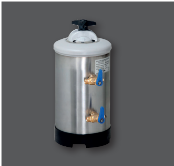
Wasi-Clean water softener, available as accessory, strongly recommended to prevent the formation of limescale deposits caused by water hardness