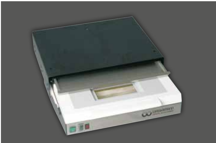
LSG-02 with additional drawer